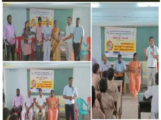
பள்ளி மாணவர்களுக்கு இடையே மது மற்றும் போதைப் பொருள் குறித்து விழிப்புணர்வு நிகழ்ச்சி நடத்தப்பட்டது.